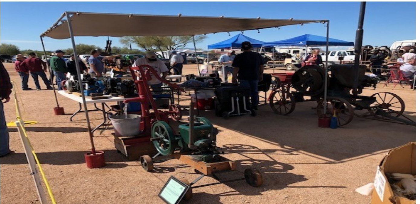
And more engines