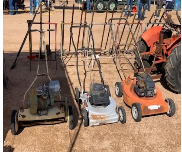
A collection of lawn mowers