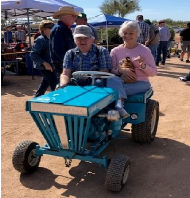
A couple cruising the show on their garden tractor!