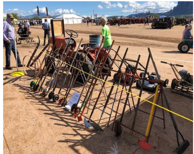
Don Winn's collection of edgers