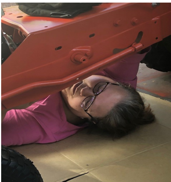
Bolting the drive shaft to the engine.

Here's how I've been keeping busy, restoring my Allis Chalmers 716H!