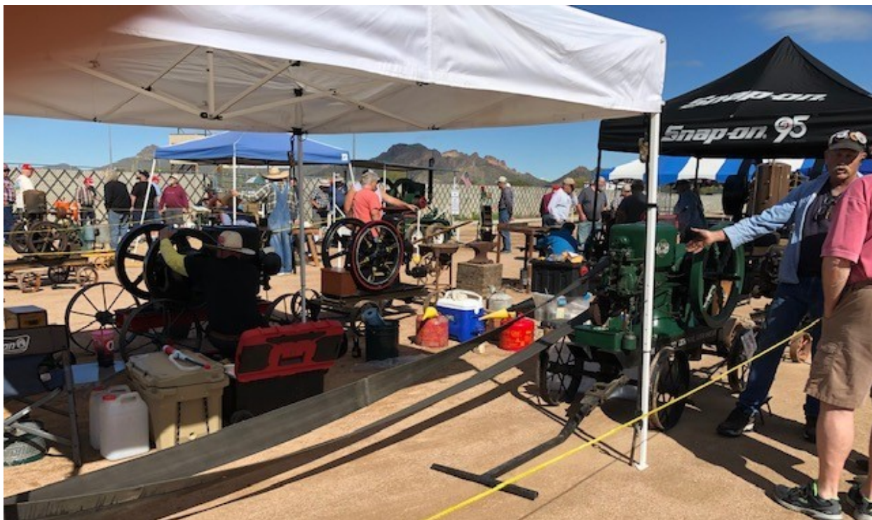
And there were lots of engines of all makes, models, shapes and sizes.