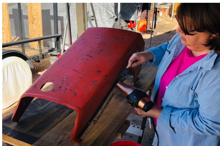
Taking the old decals off