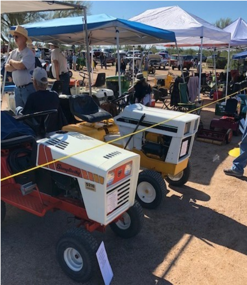
These tractors were displayed by Jim Schurz; an International and a 1985 Simplicity.